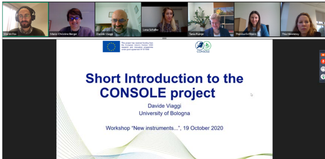
Figure 2: A snapshot of the webseminar with the speakers and organisers of the event.

A total of 133 participants had registered for the workshop and around 105 participants attended the meeting (105 participants during the first 2 sessions, and 101 participants in the ending sessions), excluding the organisers and panelists.