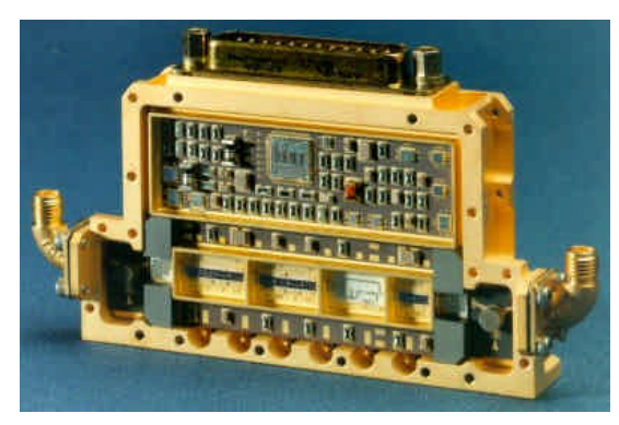
Channel Amplifier (CAMP) with a LF/RF MCM (size : 88 x 52 x 14 mm)

Based on the experience acquired by Alcatel Space in the field of microwave micropackages up to 45 GHz, mixed LF/RF MCMs were designed. They could include lead-frames, heat sinks and/or seal rings soldered with a silver-copper eutectic. All the exposed surfaces are plated. On both sides of the substrate, components, MMICs, ASICs, etc., can be bonded either inside or outside the walls defining hermetic areas<sup>(1)</sup>.