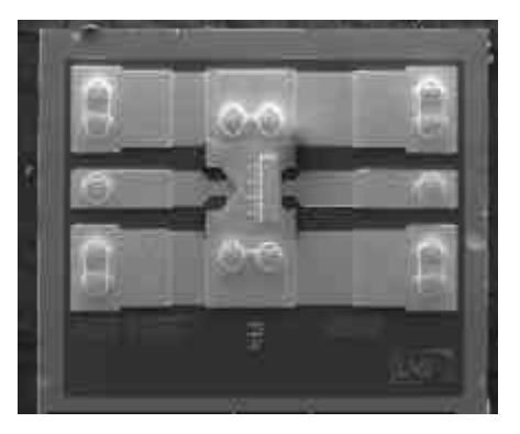
Bumped transistor in CPW topology (Photograph of UMS)