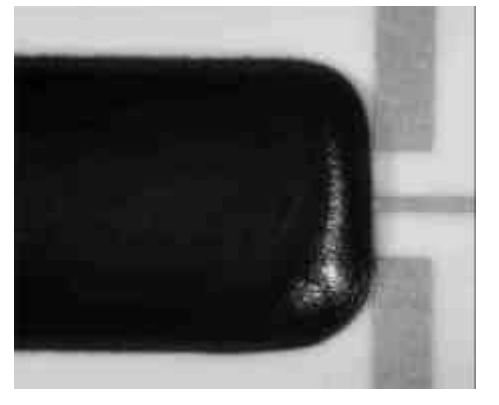
"Dam and fill" glob-top which requires accurate positioning.

The choice of "dam and fill" has been made because of its precision on the dam positioning (around \pm 20 \,\mu m).