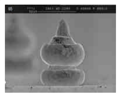
Double stacked bump

The bonding height is imposed to avoid propagation disturbance. It has been shown that a gap of 35 \,\mu\text{m} \pm 5 \,\mu\text{m} is enough for both microstrip or coplanar circuits. This can be realised with double stacked bumps using \emptyset 20 \mu\text{m} gold wire<sup>(2)</sup>.