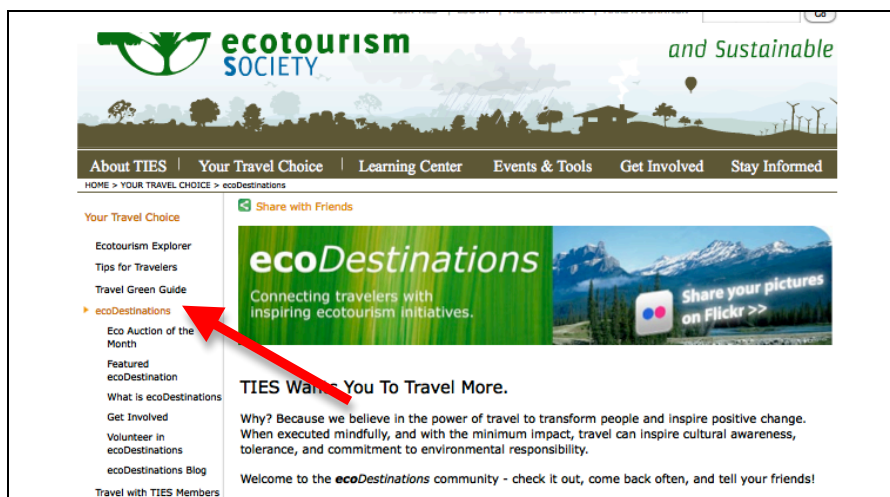
Figure 2: Link to eco-destinations from www.ecotourism.org

All those holiday packages available online at the moment of compilation were downloaded. Similarly, as displayed in figure 2, the international website of ecotourism provides links to different eco-destinations offered by local organizations around the world: