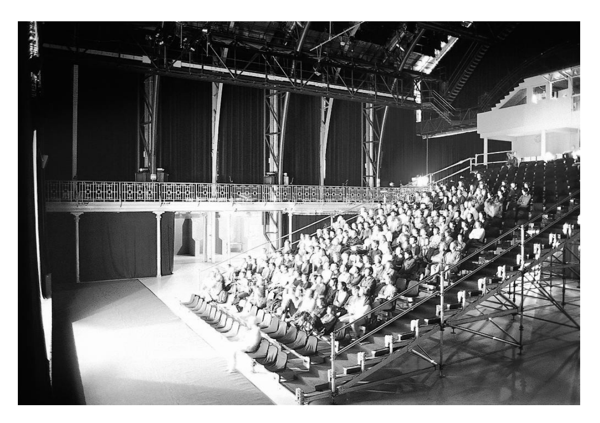
Fig.1 - Brussels, Les Halles de Schaerbeek.

The reuse of industrial buildings and the functional rehabilitation of dismantled structures are part of a consolidated operational practice which has generated, over the last decades, all over Europe, a considerable number of auditoria and theatres of small to medium size.