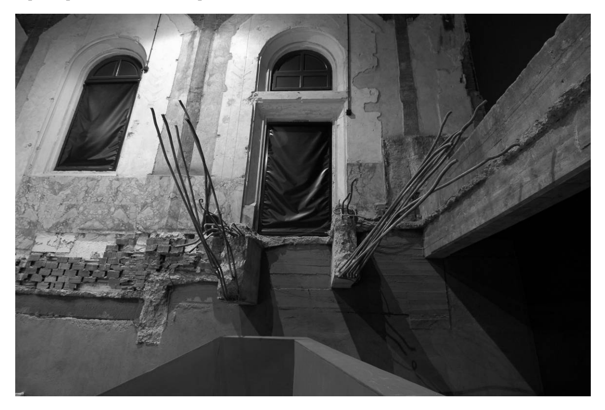
Fig. 2 – Torino, Astra Theatre (© foto Bruna Biamino).

In Italy, the constellation of special and experimental structures of the Turin-based theatre system, can be considered amongst the most vital and innovative in the European Union scenario. Thanks to an enlightened cultural policy, such small structures have promoted a vast societal participation in cultural self-produced events.