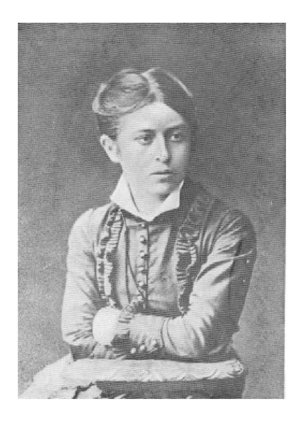
Vera Figner, c. 1880.