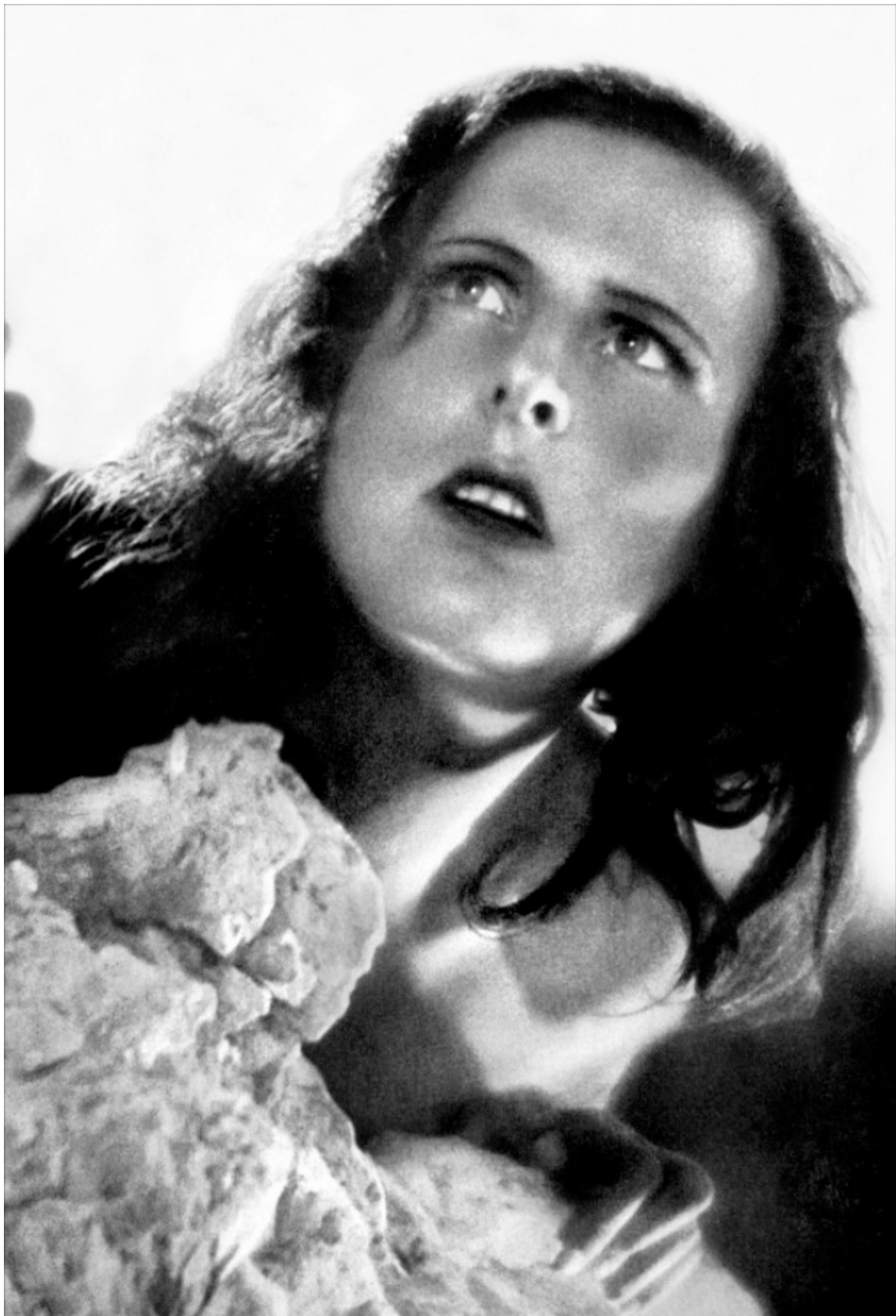
Leni Riefenstahl as Junta in The Blue Light .