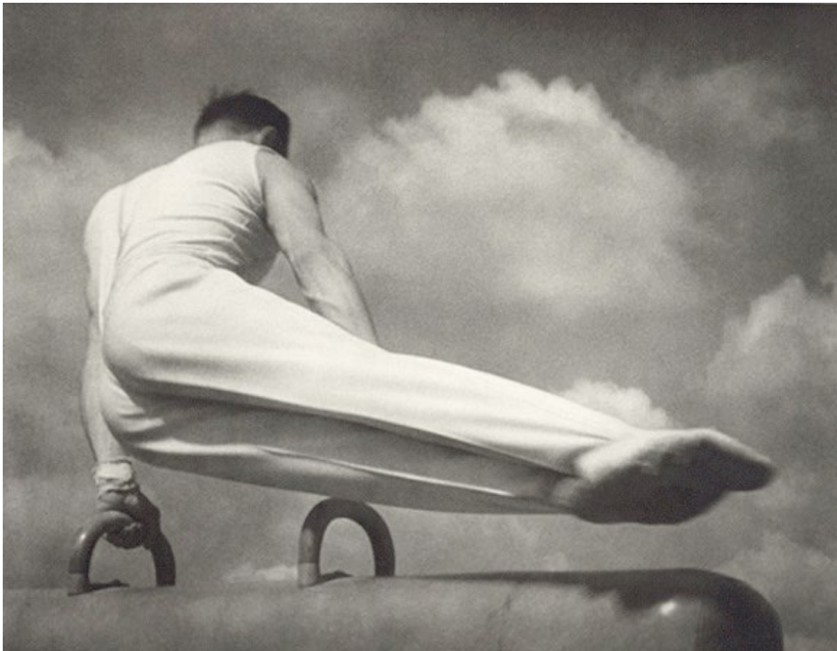
The Pommel Horse event at the 1936 Berlin Olympics in Olympia Part Two: Festival of Beauty ( Olympia 2. Teil – Fest der Schöheit , 1938).

However, I would argue that, unlike The Blue Light , Olympia wields its close-ups for purely propagandistic ends. Ironically, Riefenstahl does so by decapitating the German athletes whom she depicts. In its intense aesthetic study of the German athlete's body, Olympia's filmmaking dispenses with its vital Balázsian element: the face. As Balázs asserts, "Close-ups are the pictures expressing the poetic sensibility of the director. They show the faces of things and those expressions on them which are significant because they are reflected expressions of our own subconscious feeling. Herein lies the art of the true cameraman" (Balázs and Carter 56). During a gymnastics sequence in Olympia Part 2: Festival of Beauty ,