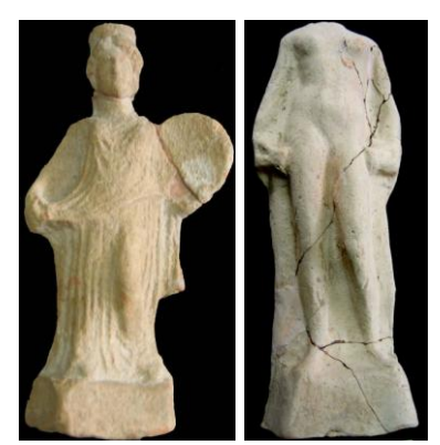
Fig. 7 Fig. 8