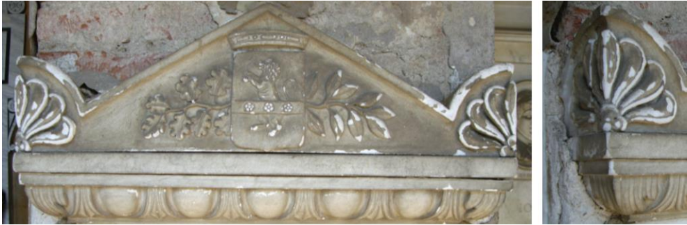
Figure 1: Sugaring marble in the Monumental Cemetery in Bologna, Italy (XIX century).

Sugaring originates from cyclical thermal excursions that outdoor marble elements experience. Daily temperature variations cause anisotropic deformation of calcite grains of which marble is composed, with the result that micro-cracks open at grain boundaries and grains start to detach (Siegsmund et al. , 2000).