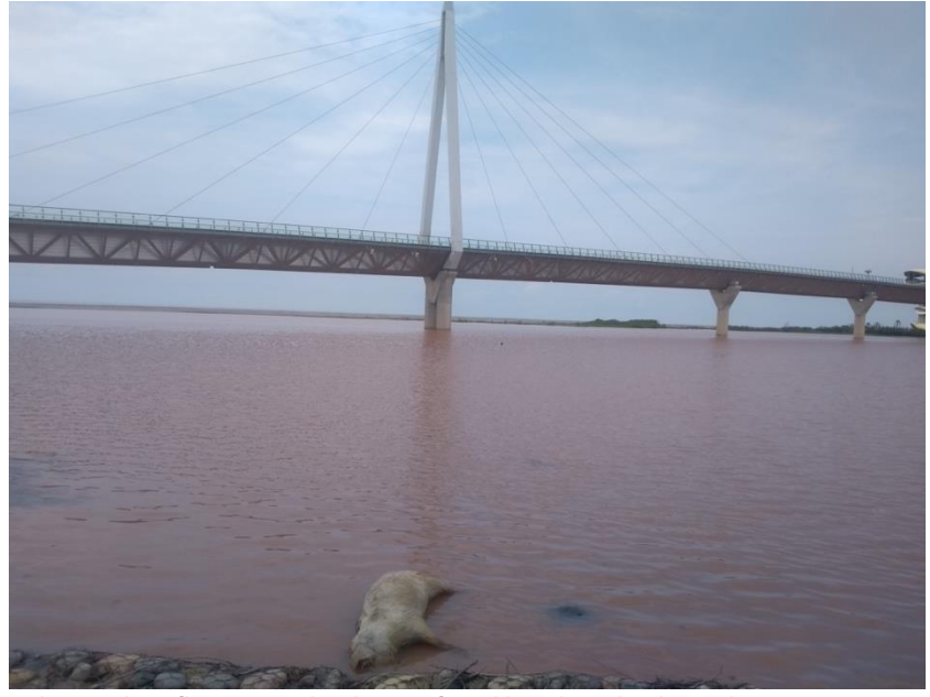
A drowned pig floating on the shores of Anaklia

As the Prime Minister hangs up, his mood has changed: "we are going to the Belt and Road conference!" he tells his companion.