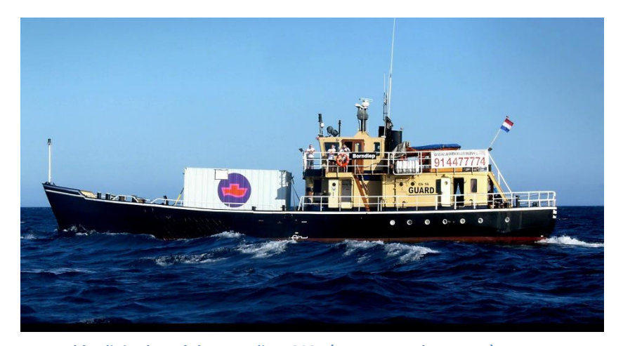
A portable clinic aboard the Borndiep, 2004 (Women on the Waves)

territorial waters, a doctor on board will provide a non-surgical abortion.